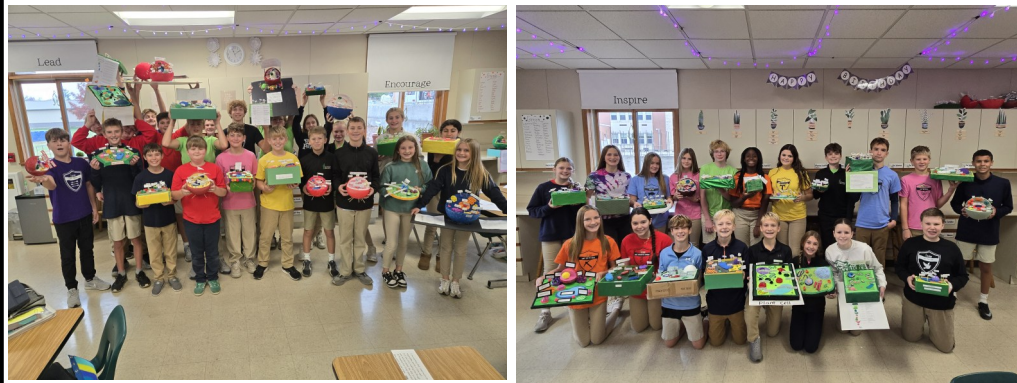
CONGRATULATIONS 6th GRADE DARE GRADUATES