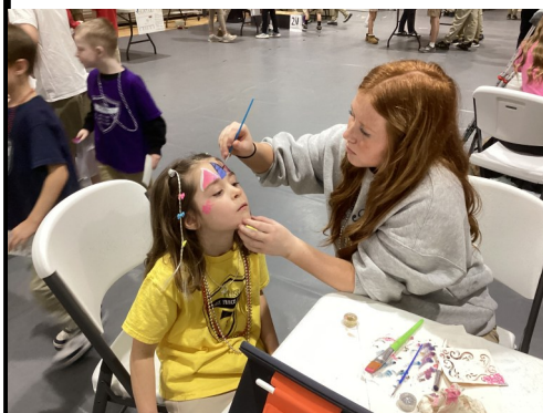
GOOD TIMES AND GREAT MEMORIES WITH OUR SCHOOL FRIENDS

We are coming together as a school family to support her.